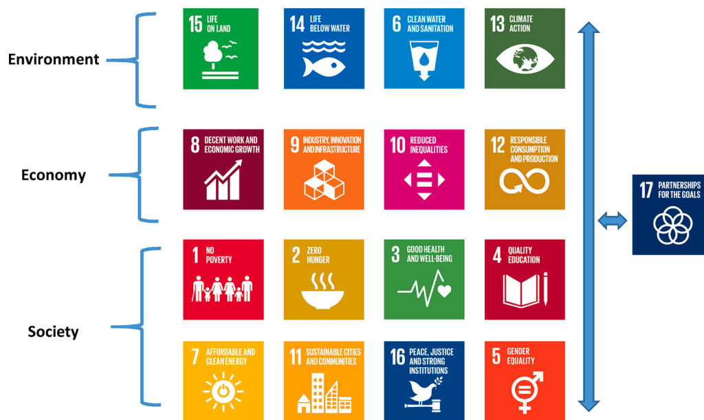
Fig. 1. United Nations' Sustainable Development Goals.

SDG13 calls for taking climate change related actions. SDG15 targets among other conservation, restoration and sustainable use of terrestrial and inland water ecosystems and their services and reduction of the degradation of natural habitats and biodiversity loss. Both SDGs call for the identification of pressures on water ecosystems and of their total economic value in such terms that can enable the identification and implementation of appropriate conservation and sustainable management policies. The achieving of these goals put policy pressures at EU level in order to identify the appropriate cooperation solutions and transboundary mechanisms that will ensure sustainable management of the water bodies. It also stresses the need to identify and apply appropriate economic methods and instruments for the integrated valuation of environmental goods and services provided by the water bodies under different socio-economic and climate change scenarios. Although the theoretical developments in economics propose alternative approaches to this issue, including monetization of the use and non-use value, choice experiments, cost-benefit analysis, benefit transfer (see for instance Koundouri, 2005; Groom and Koundouri, 2011; Davila et al., 2017; Birol et al., 2006; Pearce et al., 2006; Venkatachalam, 2004) their practical implementation remains limited.